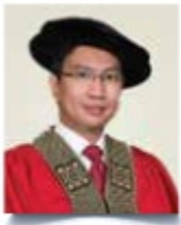
HIS HIGHNESS TUNKU ZAIN AL-'ABIDIN IBNI TUANKU MUHRIZ

The highest-ranking officials in the university, they possess in-depth knowledge and expertise in their respective academic disciplines which contribute to their reputation and credibility in the academic world.