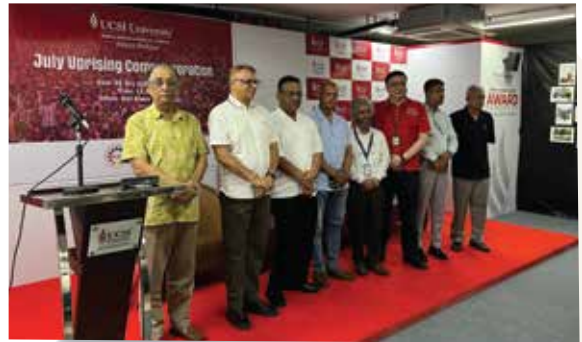
July Uprising Commemoration