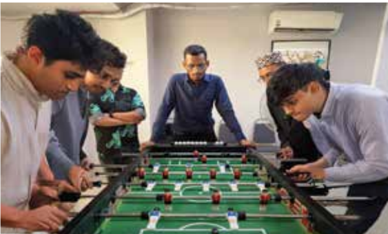
UCSI Foosball Championship