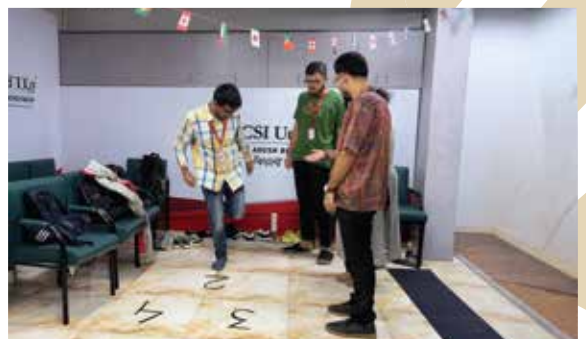
World Games Festival