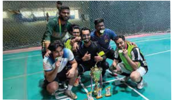
Outdoor Sports Carnival