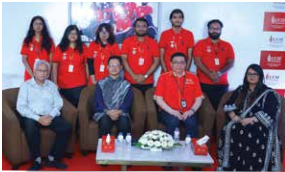
Campus Brand Ambassador

Student Affairs and Alumni at UCSI University Bangladesh Branch Campus play a pivotal role in organizing vibrant and engaging events that enrich the student experience and strengthen the alumni community. These events range from academic workshops, cultural festivals, and sports tournaments to career fairs and alumni networking sessions. By fostering collaboration and a sense of belonging, these initiatives not only celebrate student talent but also provide a platform for mentorship and professional growth through meaningful interactions.