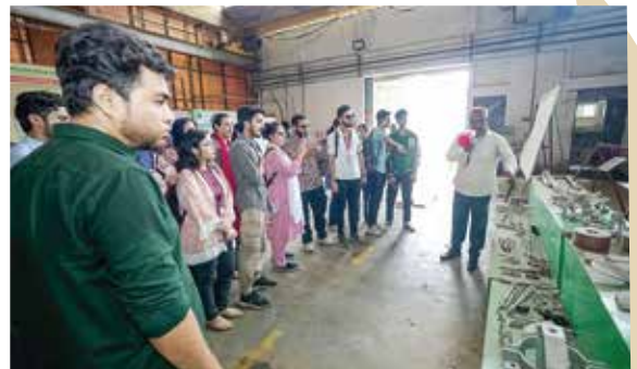
Industrial Visit (BMTF, Gazipur)