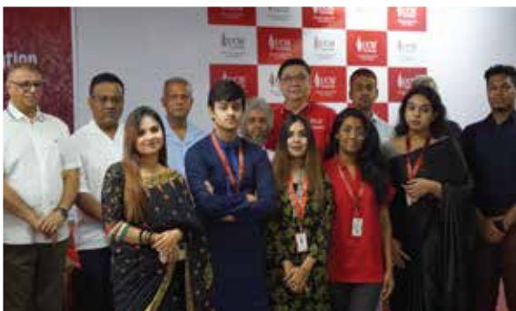
July Uprising Commemoration