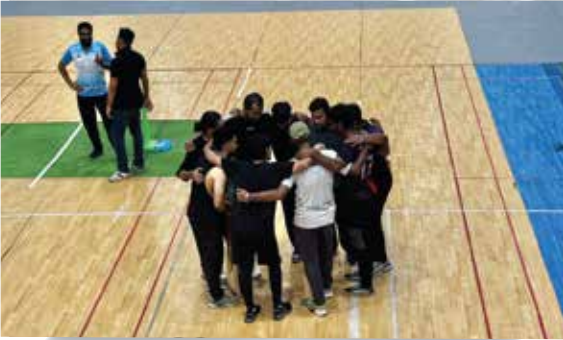
Campus Cricket Cup